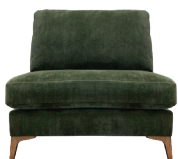
W- 78cm H- 87cm D- 103cm