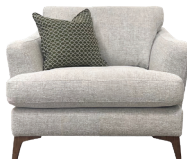
W- 98cm H- 87cm D- 103cm