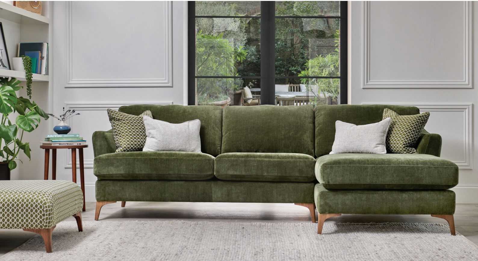
Image shows Left Hand Facing 2.5 seater with a Right Hand Facing Chaise in Manhattan Conifer with Smoke wood feet