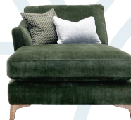
W- 100cm H- 87cm D- 161cm