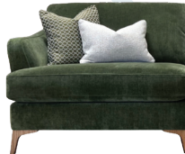
W- 114cm H- 87cm D- 103cm