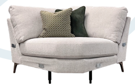
W- 118cm H- 87cm D- 118cm