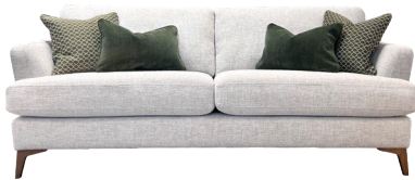
W- 220 cm H- 87cm D- 103cm