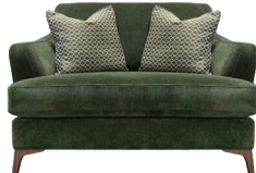
W- 132cm H- 87cm D- 103cm