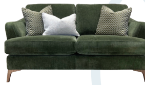
W- 170cm H- 87cm D- 103cm