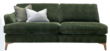
W- 202cm H- 87cm D- 103cm