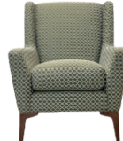
W- 79cm H- 89cm D- 89cm