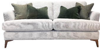
W- 196cm H- 87cm D- 103cm